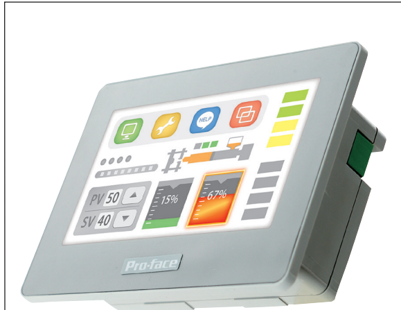
4.3 inch TFT Color LCD Compact HMI